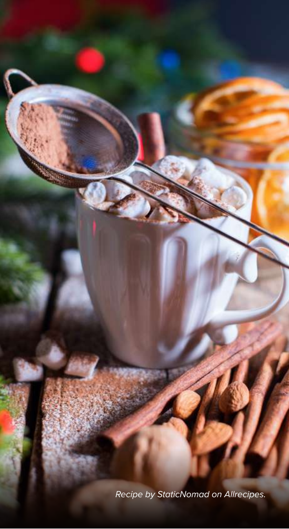
Recipe by StaticNomad on Allrecipes.